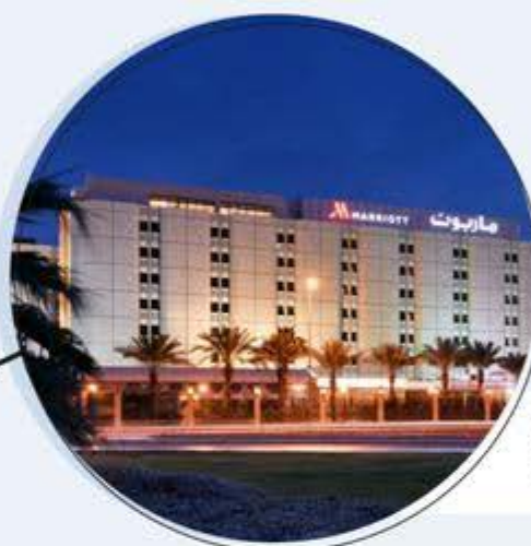
Marriott Hotel Riyadh, Saudi Arabia