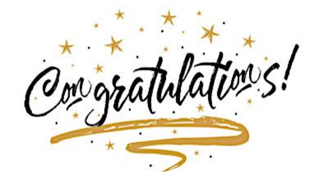
AWARDS WERE SUPPORTED BY:

The awards were presented virtually during the WISN business meeting at IADR.