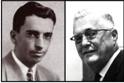
Peyton-Skinner Award for Innovation in Dental Materials