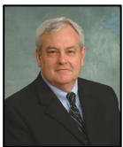
Stephen Bayne Mid-Career Award

Professor, Faculdade de Odontologia, UNICAMP, Piracicaba, SP, Brazil